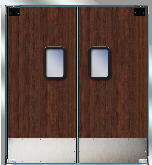
9000HPL shown with optional 12" impact plates.